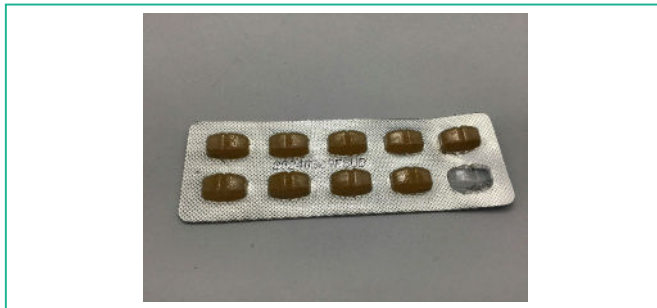
The photo on this report is of a sample collected by the lab and may vary from the final packaging